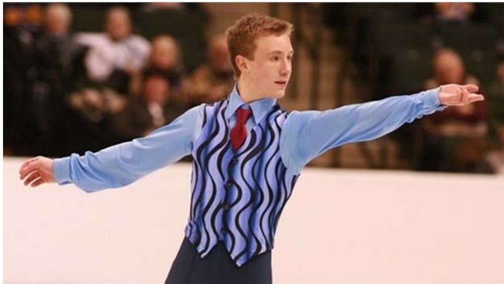
Champion Figure Skater Ross Miner

The remaining phase of the event is a two-hour ice show featuring figure skating from several local skating clubs, a 22-member synchronized skate team and special singles performances by Todd Eldredge and Ross Miner. Ticket donations for the figure skating show are $20 each.